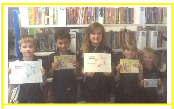
Award winners for week 2